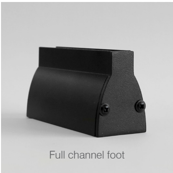
Full channel foot