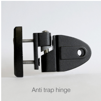
Anti trap hinge

For more details on the alternate options for the Slide range, please see our technical data online or speak to our sales team.